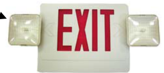
Shown with optional Emergency Heads (2H)